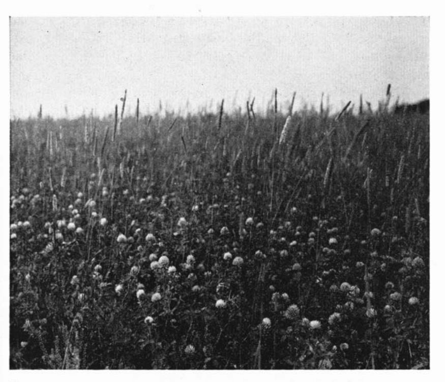
Clover-grass mixtures make excellent hay and are better for controlling erosion than red clover alone. This is a timothy mixture. (Fig. 2)