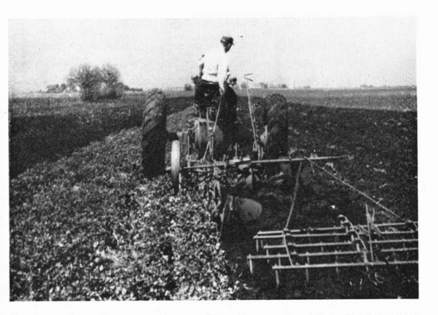
Turning under a clover crop is a good farming practice. Red clover enriches the soil with nitrogen, and also helps to maintain good tilth by mellowing and granulating the soil. (Fig. 4)

Of the total nitrogen in clover, two-thirds is in the plant above the ground and one-third is in the roots. When two crops of clover have been removed from the land, the nitrogen left in roots and stubble is about equal to that taken from the soil by the crop. Nitrogen is the only plant food that can be maintained just by properly rotating crops.