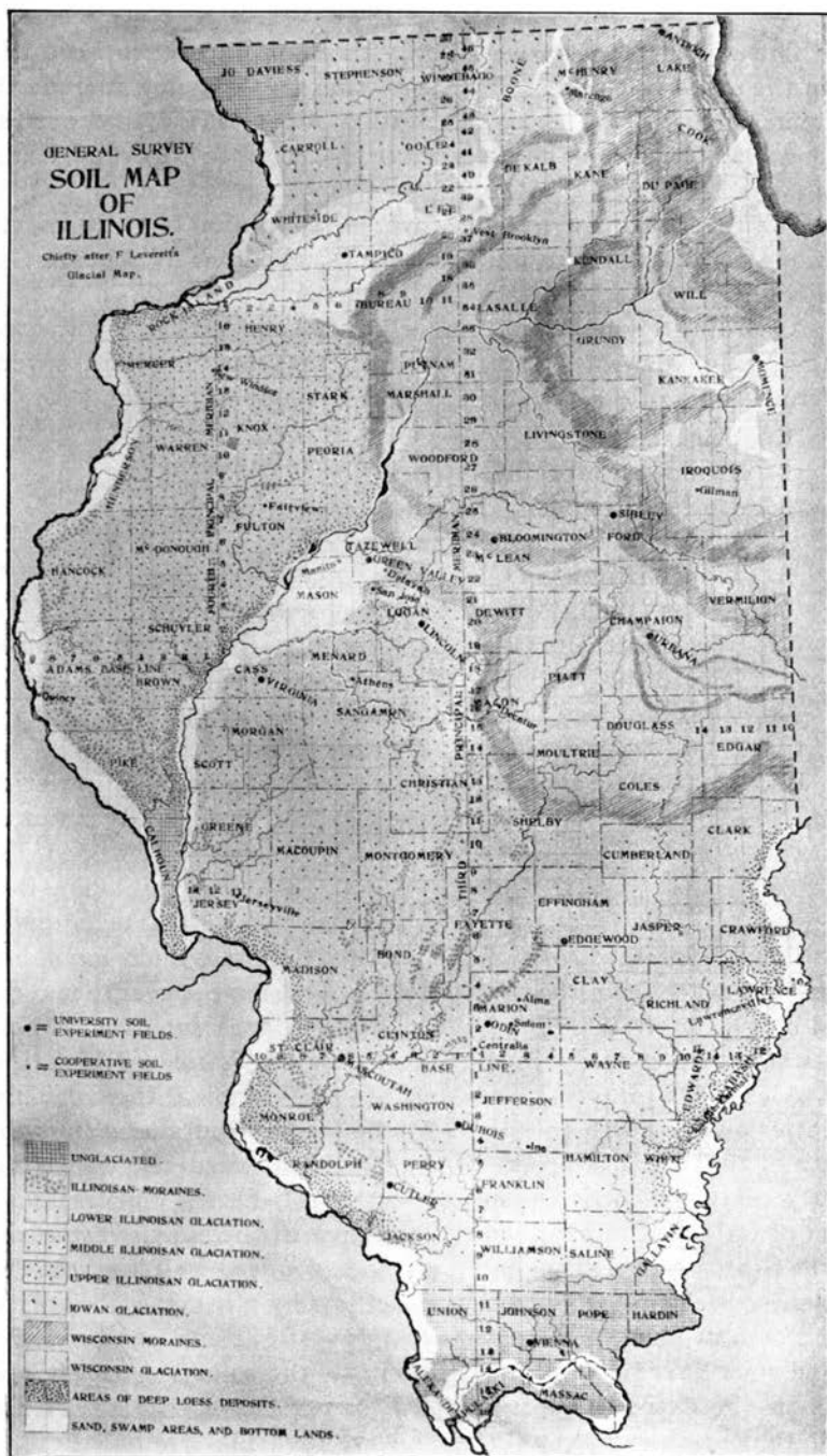
PLATE I.—From Leverett's Glacial Map of Illinois.