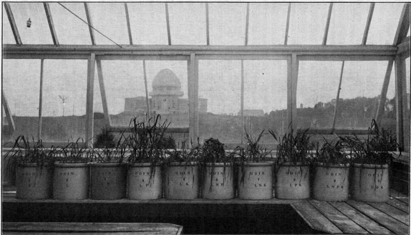
PLATE III.—Wheat on Lower Illinoian Glaciation Soil (Marion County Prairies) Effect of Phosphorus.