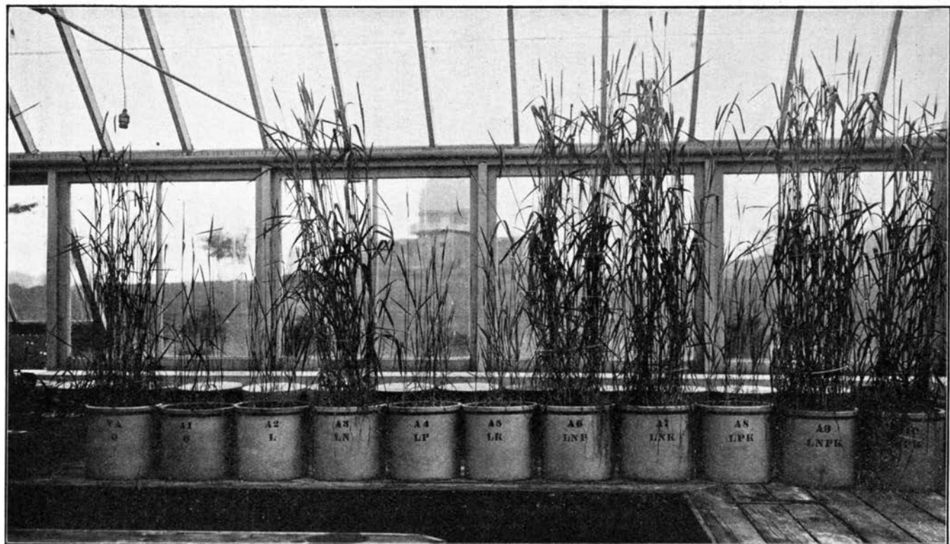
PLATE II.—Wheat on Unglaciaded Soil (Pulaski County Hills) Effect of Nitrogen.