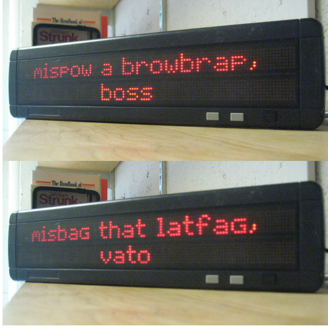
Figure 1. Example output from ppg256-4.

ppg256-4 was developed to drive an LED sign in an art gallery and contains all of the control code necessary to drive the sign. This generator produces a set of utterances – vaguely aggressive commands that include coined kennings. The utterances are meant to suggest a speaker of a certain gender (male) and to highlight how racial standing influences everyday speech with terms such as "dogg" and "vato.". The possible lexical combinations for a syllable include "fag," an offensive term that is in keeping with the tone of the generator and can remind a reader that offhand expressions include reference to sexuality as well as gender and race. These texts are