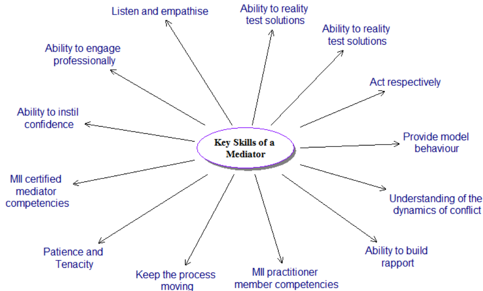
Figure 1. Mediator skills.

The results of which were imported into Banxia's™ Decision Explorer™ mind mapping software, where it was analysed and manipulated accordingly. Each of the interviews were amalgamated and dissected, resulting in the documentation of the following findings.