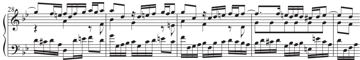
Example 4: Fugue in G minor: bars 28–32

interchange of the tenth and doubling in thirds, 3 as already shown in Example 1b, likewise provides spikily coloured secondary seventh chords in every bar. This fugue has double exchanges in both the subject and the countersubject. From a technical point of view, however, the interchange at the tenth is rarely used, especially in double fugues, owing to its complexity. 4 For those who know the technical difficulties associated with the use of this technique, this fugue is a particularly powerful demonstration of Bach's compositional skills.