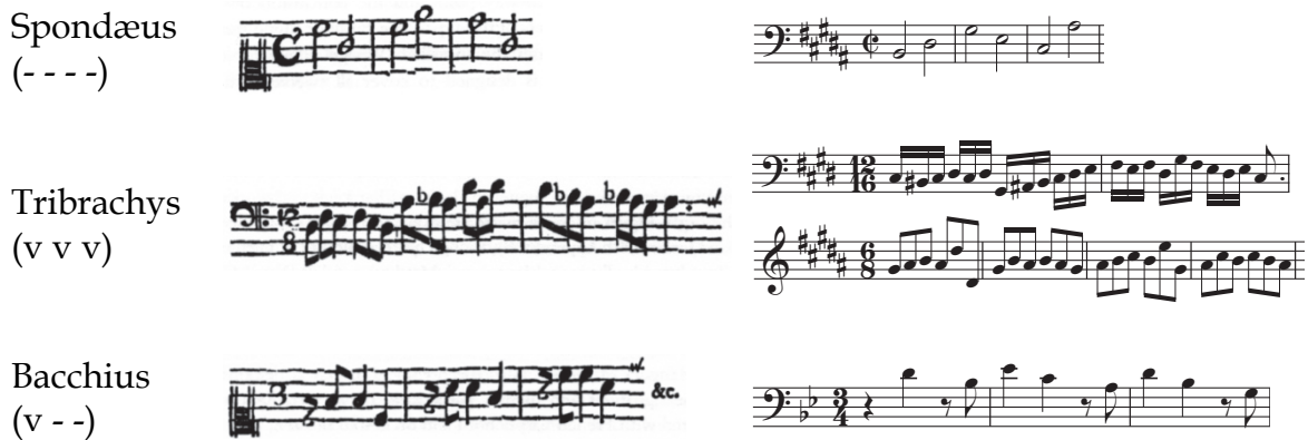
Example 12: Mattheson's examples (1739) of rhythms possibly taken by Bach for the subjects of WTC II fugues

age, which suggests that he was aware of and responding to contemporary theoretical discussions.