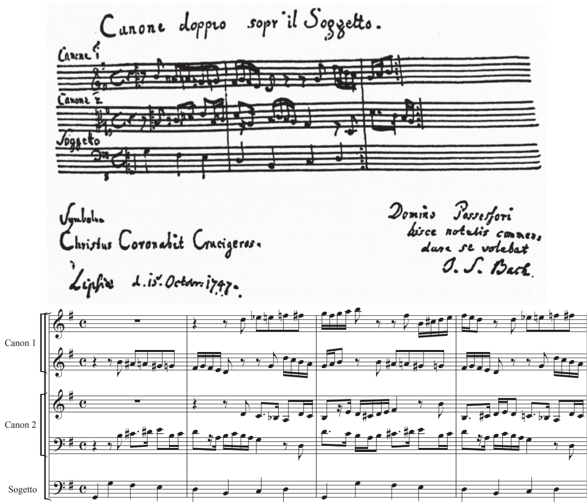
Example 7: The 'Fulde' canon (BWV 1077) and its realisation (first four bars only)

From the way these fugues were composed, it seems reasonable to infer that the procedural planning was completed before the fugues were written out. Not only is the sequence of sections logical, the effect of the actual fugues is also powerfully dramatic. The most interesting thing these examples show is that the methodical structuring of these fugues may be connected to the deep-rooted purpose of writing them - a secret which is yet to be decoded.