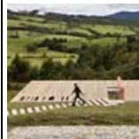
Santa Elena House