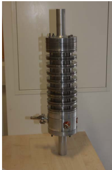
Figure 1. Aluminum prototype 9 cell crab cavity with HOM and power couplers.

The prototype, shown in Figure 1, allows the addition and removal of the couplers, and we constructed some of the possible coupler designs proposed for the ILC. The cavity was initially constructed to be azimuthally symmetric; however a series of metal disks could be bolted to the equator of the cavity polarizing the cavity by splitting the two dipole polarizations by 12 MHz.