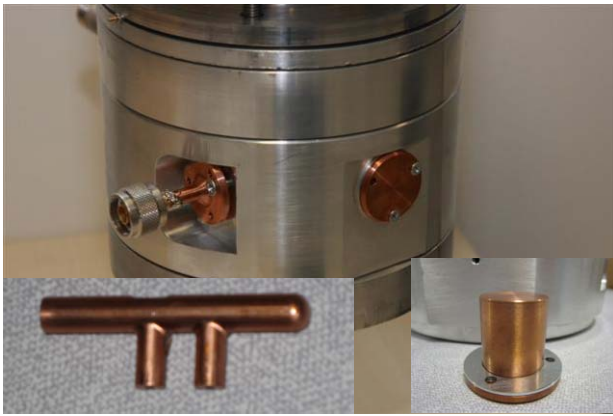
Figure 3. The prototype HOM coupler, with F-probe (inset left) and adjustable can lid (inset right).