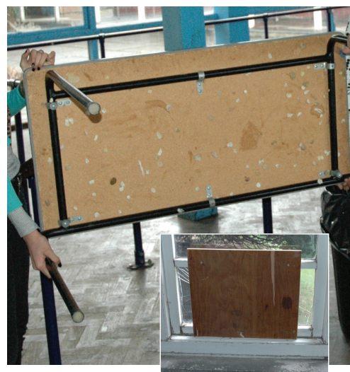
Plate 6: Chewing gum and general deferred maintenance, School 1

Some of the rooms are quite dusty, yeah it’s like quite thick dust, in the cubicles when you look down there is a thick layer of dust and you leave your bag there and it gets all dusty and then you’ve got your coat and you’re not allowed to put your stuff on the table. I reckon they should have somewhere that you can hang your bag.