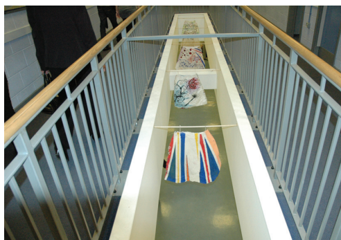
Plate 5: Lightwells in School 2 were much appreciated

“ There’s mould everywhere, the place is crumbling. The classrooms are all falling to bits, writing on the tables and on the walls and paint peeling off and broken blinds. There’s an English room which is mouldy and there’s like a damp patch in our form room.”