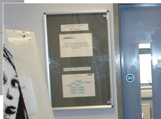
Plate 10: Branding and consultation by the FM service provider in School 2. The notice board next to the MITIE office door is a 'Commitment Board' with a statement from MITIE saying 'MITIE Pfi in partnership with the LEA school and Land Securities Trillium provides a non-educational service to XXXX school'. Below this statement is the MITIE staff structure.