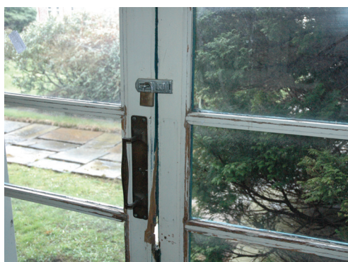
Plate 2: Blocked off Courtyard: School 1

One of the most strongly articulated and frequent set of comments concerned informal social spaces. The original design of School 1 included a series of interior courtyards which had been closed off (Plate 2). In School 2 some outside seating had been added (Plate 3) but we were told that the only place to gather outside was under an access bridge (Plate 4).