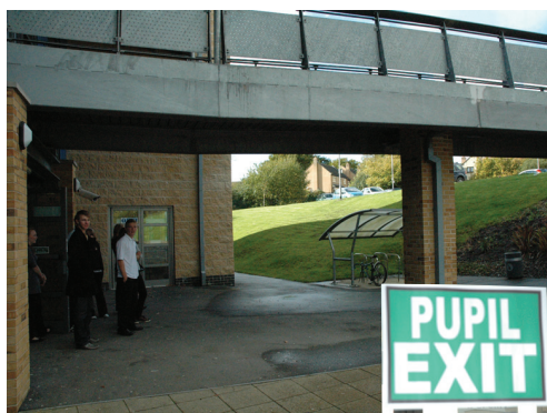
Plate 4: Pupils' congregation space under the bridge and (inset) the sign on the door

Because schools, as well as a place of learning, a place where you socialise and you see your friends for more time than in any other place, unless you live with them, so it's really important to have somewhere to socialise. I suppose for lads it's alright because we play football on the AstroTurf, but for girls there is absolutely nowhere, they just end up sitting anywhere and lounging about, like stairwells and stuff.