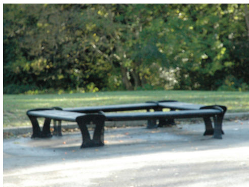
Plate 3: Benches rearranged at School 2