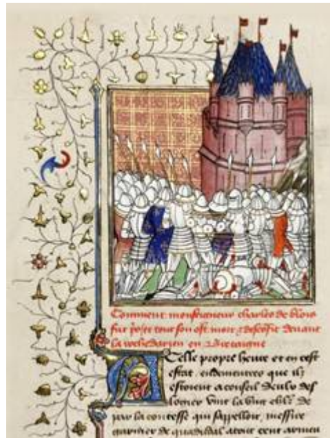
Figure 3. Image from The Chronicles of Froissart Bibliothèque Municipale Besançon, ms 864, fol 150.