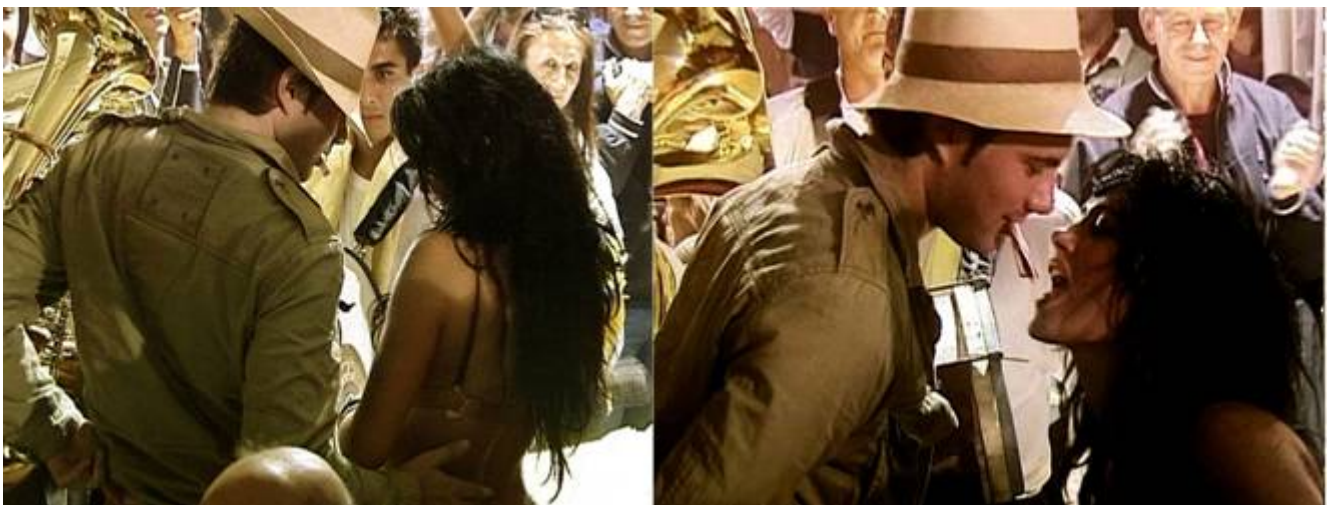
Figure 1. Stills from The Most Beautiful Woman in Gucha, Breda Beban 2006.

The edited version (Figure 1) focuses on an interaction between two people: a professional dancer performing at the event and a young man who very briefly dances with her while she is performing. In the context of the complete unedited video this is a very fleeting passage and might not be noticed by a viewer. Beban has homed in on the interaction between her two main characters and by the use of highly selective editing and slow motion passages to amplify the key moments has revealed an intense, if fleeting, engagement. In the normal speed sections we hear the energetic music and hubbub of the event but when the couple move together for their artificially prolonged exchange the soundtrack changes to a slower, romantic, sensual music to accentuate the intimate hidden moments revealed by the artist.