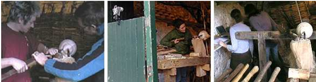
Figure 4 Learners in the workshop.

development. In much the same way as Ehn and Kyng 17 used their “cardboard computer” to enable print workers to imagine using a computer that had not yet been built, my note book and video clips allowed both myself and learners to imagine how the learning resource might work. By playing the role of interface between the learner and the material, I was able to involve responses from the learners and adapt the material I had dynamically during sessions to maximise their impact.