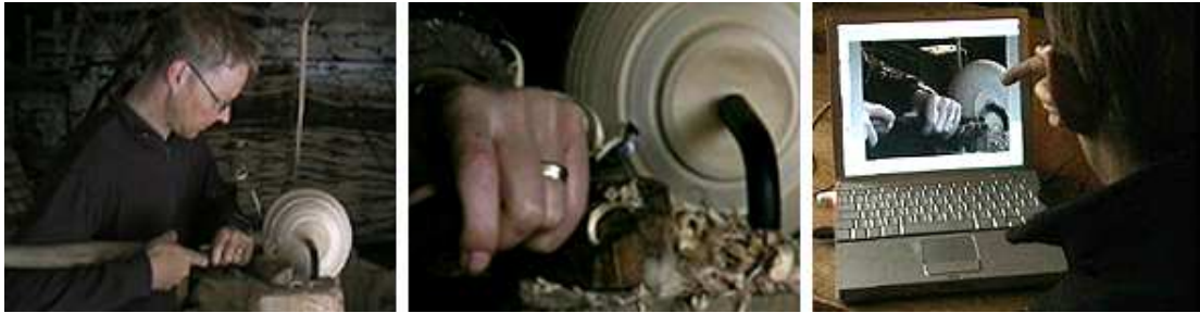
Figure 1 Craft practitioner: traditional bowl turner, Robin Wood.

To consider in greater detail the acquisition, representation and execution stages: