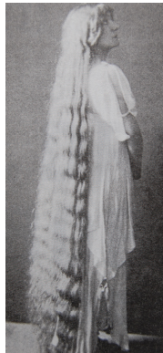
Figure 2, Long hair of the 1900s (Cox 1999)

Little research has been undertaken on ideas of dirt and grease in hair; research mainly concentrates on styles and fashion. However, such studies do allow some conclusions to be drawn about ideas about grease and dirt in the hair. In the recent past the idea of having grease in hair was accepted as a way of styling it, including for example styles in the 1980s and styles of the youth-based subculture called 'Greasers' in the 1950s. In the early twentieth century grease in hair seems to have been more acceptable, even being visible and encouraged. Women were keen to have natural looking hair that was shiny, sleek and healthy looking (Figure 2). Earlier, men had used Macassar oils to make their hair glossy, leading to the conventional use of a small cloth, known as an antimacassar pinned to chairs and sofas to keep the upholstery from being damaged by the greasy Macassar oil. This 'good' grease was not only visible on the hair but also on the things that came into contact with hair. The scale of the change in our relationship to hair grease is demonstrated by the degree to which in our hygiene aware and resource intensive century this level of grease would be unthinkable and frowned upon. (Cox 1999)