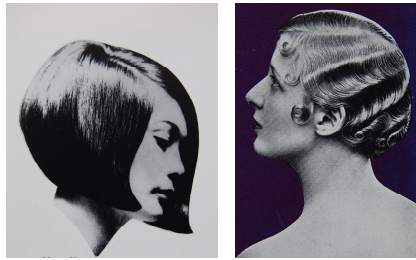
Figure 4, 5, 1960's Vidal Sassoon graduated Bob and 1920's Bob with wave (Trasko 1994)

when women started to backcomb their hair to create body and lift during the 1950s (Cox 1999, Sherrow 2006). The diversity of round brushes, vent brushes, paddle brushes, cushion brushes etc. that are available now are designed for specific techniques of blow-drying and styling hair (Daerlos 2005) (figure 6,7) and to encourage women's autonomy from the hairdresser by making it possible to create a style easily at home. One side effect of this is that the use of metal and stiff plastic brushes has led to trichologists increasingly warning women of the damaging effects on the hair of the extensive use of brushes and combs (Kingsley 2003). From being a process that benefits hair health, in combination with chemical cleansers and conditioners brushing and combing now threaten it.