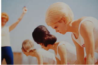
Figure 3, 1950s Bouffant style (Trasko, 1994)

The Victorian convention of brushing the hair one hundred times each night was intended to move excess hair grease from the scalp to the ends of the hair – distributing it evenly. Regularly brushing was believed to encourage a healthy production of natural oils - grease was moved, not necessarily only removed. In this era, natural oils gave hair a shininess that was a sign of a healthy person. Combs were used to keep the head free from disease, often having two sets of teeth with different spacing, one fine set for cleansing including removing lice and their nits and the other set with wider-spaced teeth for styling (Cox 1999, Sherrow 2006). Whereas dust and lice were removed from the hair, a certain amount of grease was tolerated. Specific methods and techniques for using combs and brushes for cleansing were still advocated until the 1950s – the time of the bouffant and beehive when brushing became once more an important part of the beauty routine, as the style meant hair could only be washed infrequently. Furthermore, the styles of the 1950s were rather time-intensive to achieve and required a liberal use of lacquer hair that needed to be brushed out (figure 3) (Cox 1990).