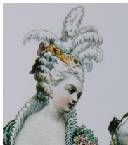
Figure 1, Powder and wigs 18 th Century (Trasko, 1994)

In Douglas' social theory of dirt she suggest that 'as we know it, dirt is essentially disorder. There is no such thing as absolute dirt: it exists in the eye of the beholder' (1984:36). When people wash and clean they are making their environment i.e. hair conform to a societal pattern. Douglas illustrates this with cleaning the house, 'we are separating, placing boundaries, and making visible statements about the home that we are intending to create out of the material house' (1984:69). As outlined above, our embodiment of smell, touch and sight and our knowledge indicate to us when to deal with hair. How 'dirt' is detected and what is considered 'dirty' reveals a reconfiguration of social ideals that are dynamic and change through time. What is acceptable or non-acceptable dirt in hair partly depends on our ideas of cleanliness in the society we live in.