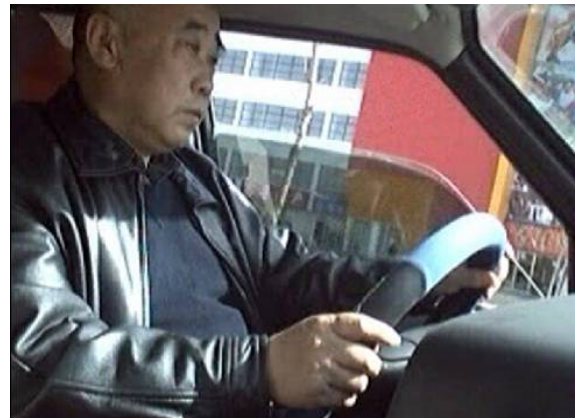
Figure 2: Observation