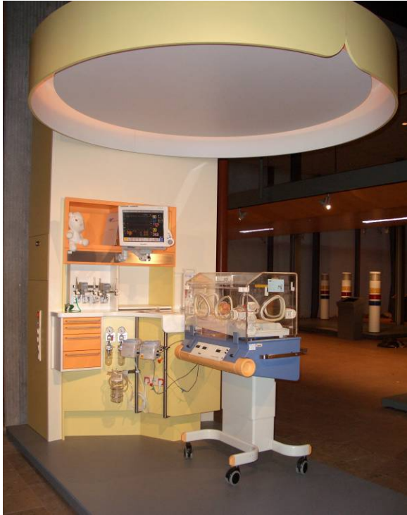
Fig. 3. Family Shell prototype

In the new design the child is placed central and the appliances have been pushed to the background. Family Shell provides the parents with some privacy in the patient area. Parents indicated that they wished they had more power to change the situation. Although this is hard to realize through design, an attempt is made by providing them a way to individualize the patient area.