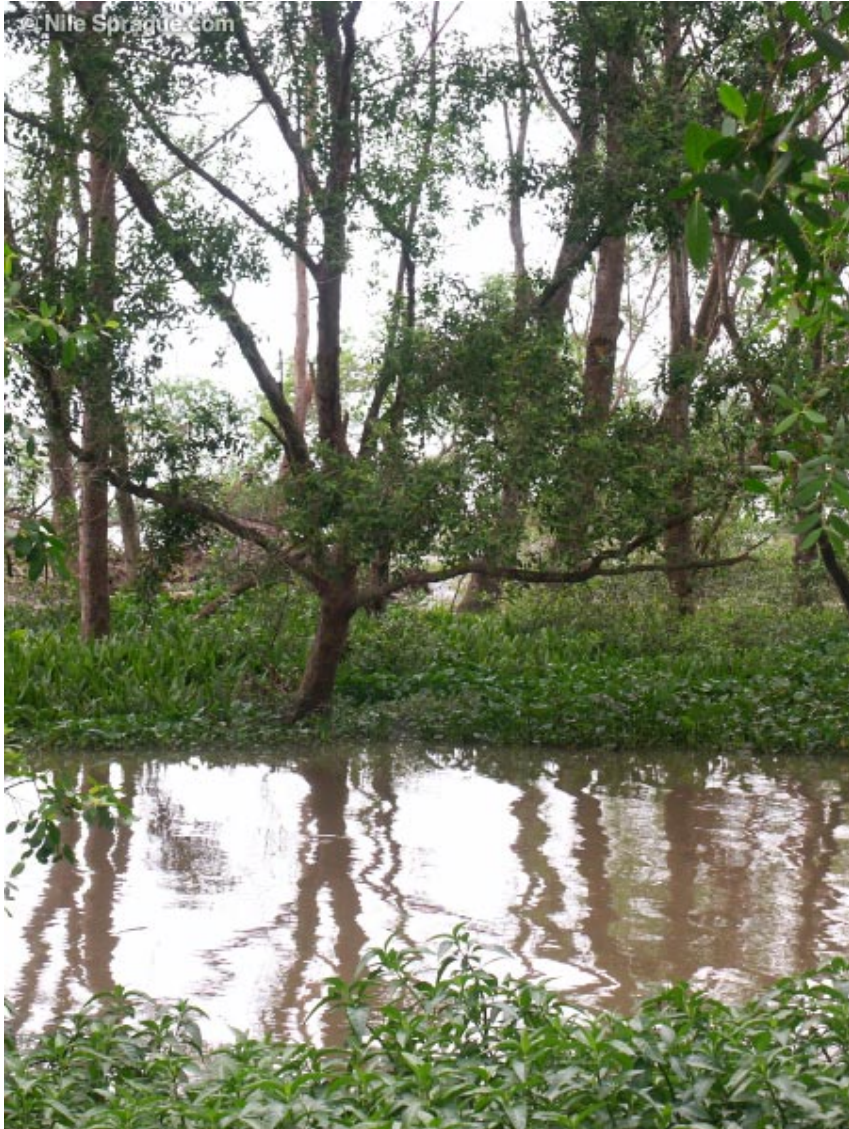
Marsh water in the Mekong River Delta, Vietnam