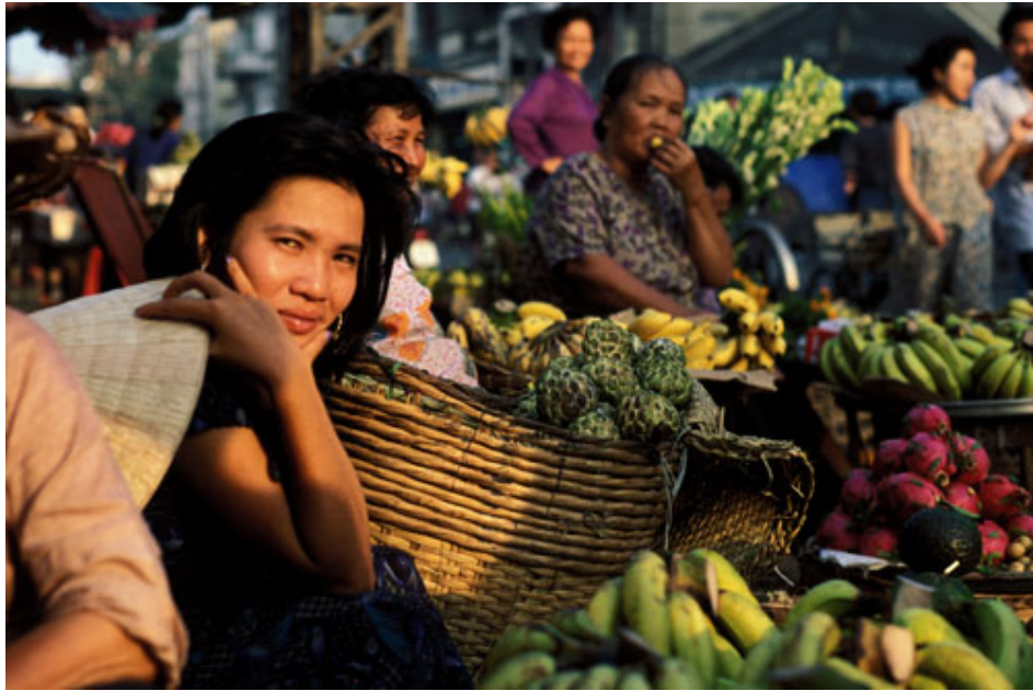
People in a market in Mekong delta