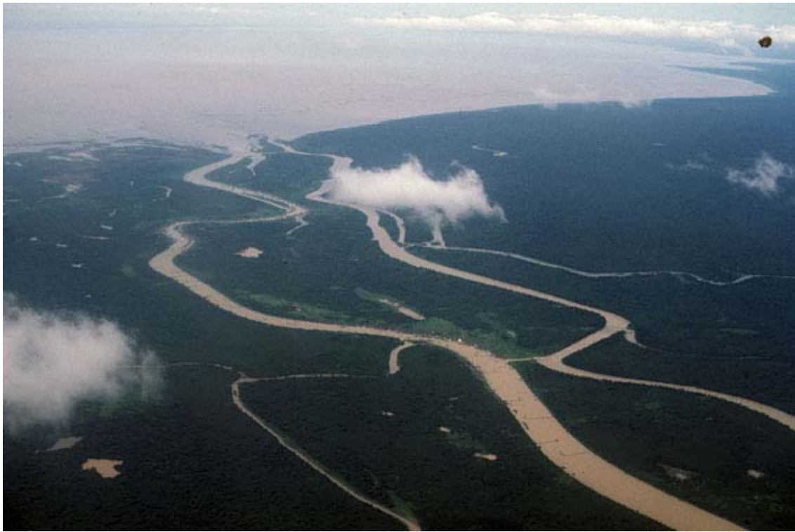
Aerial view of Mekong River joining Tonle Sap Lake near Siem Reap