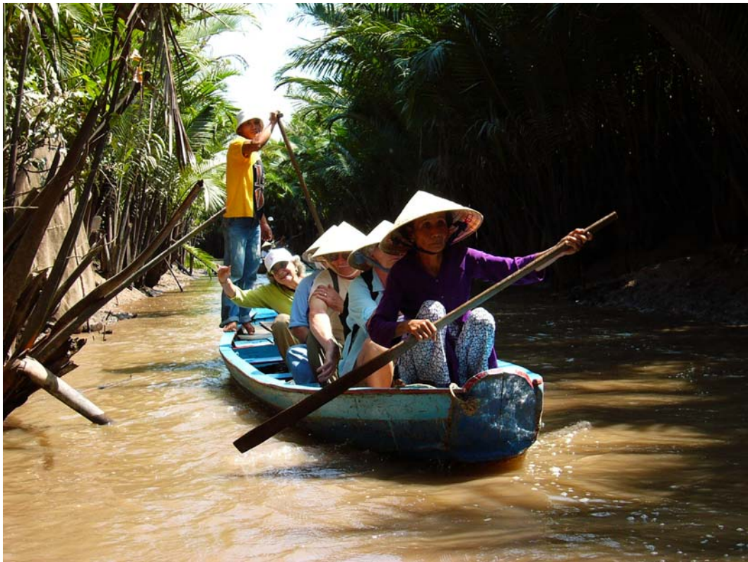
A canal in Mekong delta