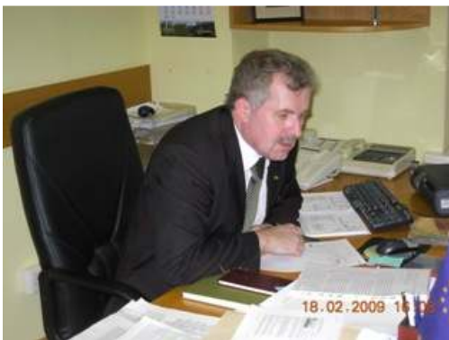
Arvydas Anusauskas, historian and Member of Parliament, at his office in the Seimas on 18 February 2010.